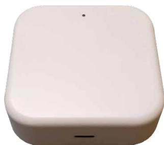
Wifi Hub / S651