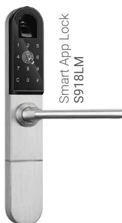
Smart App Lock S918LM