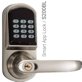
Smart App Lock / S200BL